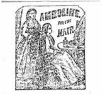
Bi-tonal, low-resolution images scanned from microfilm, as in other databases, are barely readable

There are many thousands of illustrations in Illustrated Civil War Newspapers and Magazines . Every page has been scanned to grayscale or color standards at 600 dpi—a very high resolution that makes even small images easy to view. Large versions are displayed in all their glory—showing every crisp line of the lithographs and the photographs appearing in sharp display.