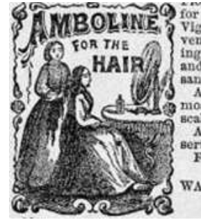
In Illustrated Civil War Newspapers and Magazines , high-resolution images provide superior quality and